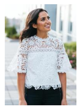
AlTai, Amina THE AMBITION TRAP: A Blueprint for Releasing Hustle, Finding Purpose, & Driving Change